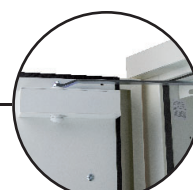
Self-closing door(s) with thermo-fuse