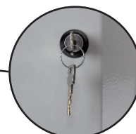
Key locking System