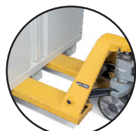
Moving by pallet truck (empty)