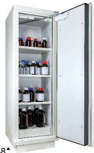
794+E + C148*