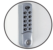
^ Option Code lock SERCODE (1 per door)